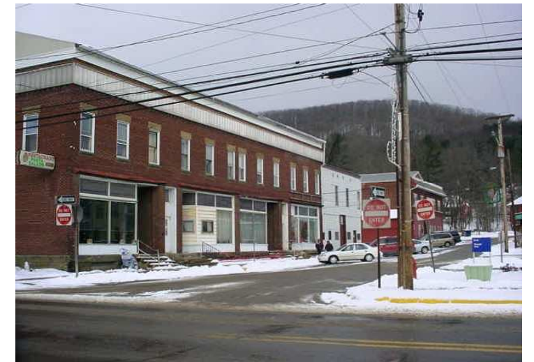
Scene from downtown Sheffield

This is particularly unfortunate, because Warren County's small town Main Streets have been disproportionately affected by countywide depopulation and economic decline. A high number of older buildings are vacant or underutilized. Many are in relatively poor condition and/or suffer from ill-conceived "band aid" modernizations. Streetscape improvements are either unaddressed or incomplete due to funding limitations. Although there have been efforts over the past twenty years to address these issues, it's been on a sporadic, non-coordinated volunteer basis as none of these towns has the funding or size that would justify a full-time planning or development staff. According to Pennsylvania DCED, only 14.8% of the county's municipalities even have a planning commission. Without adequate planning, development lags and potential state or federal funding is left on the table. The result is further population loss as people—especially younger, educated residents—relocate elsewhere.